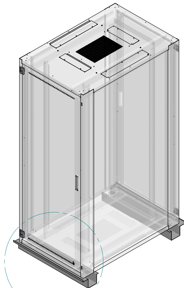
Individual Pallet Feet