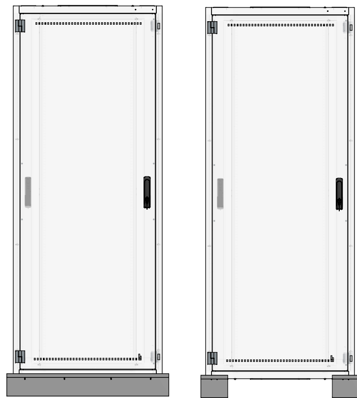
Full Width Pallet Rails