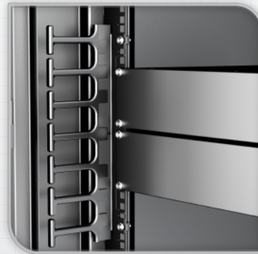
(using existing mounting screws to mount ontop of equipment)

Note: Images are for indicative use only, and may vary from actual product.